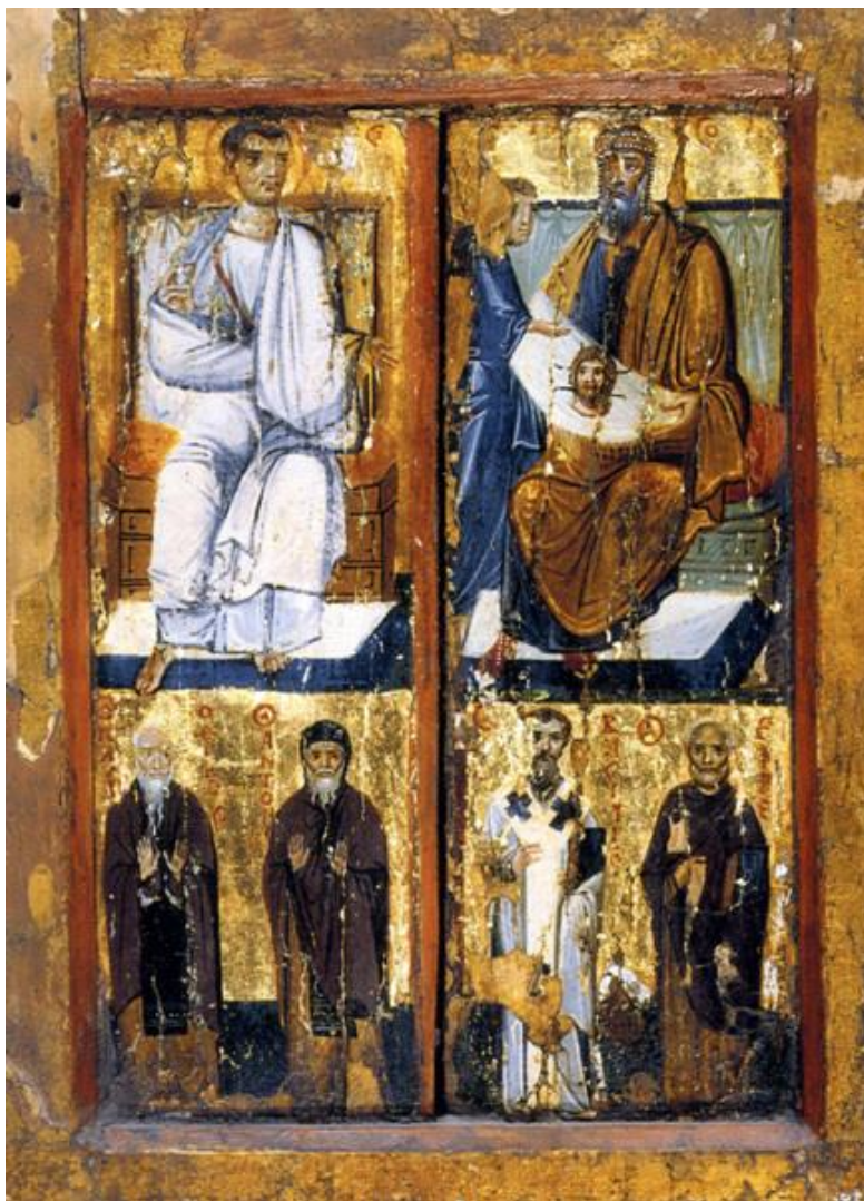
St. Taddueus; King Abgar receiving the mandylion; Saints Paul of Thebes and Anthony the Great; Saints Basil the Great and Ephrem the Syrian tempera on wood, the Syrian-Palestinian area, cca 940, St. Ekaterina Monastery , Mount Sinai.