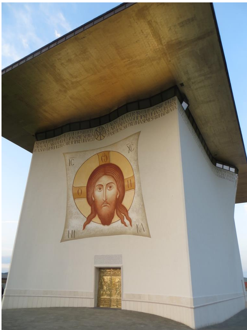
The 'Noetic Ark', Alba Iulia, photo -Vladimir Bulat, 2015