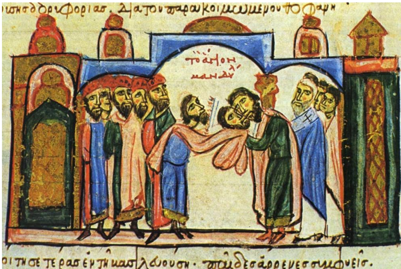
Immagine edessena. Madrid, The National Library of Spain, Codex Skylitzes, ms Vit. 26-2, Synopsis Historiarum , sec. XIII, f. 131